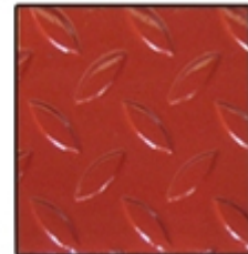
Chequered loading surface